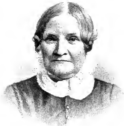
LYDIA MARIA CHILD.